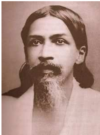
Sri Aurobindo, 1916

The Knowledge and the Ignorance The Spiritual Evolution